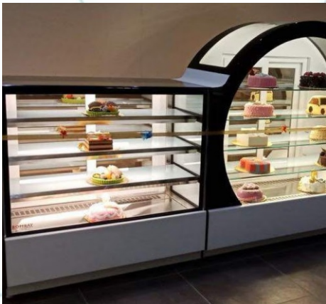
Round Cake Display Counter