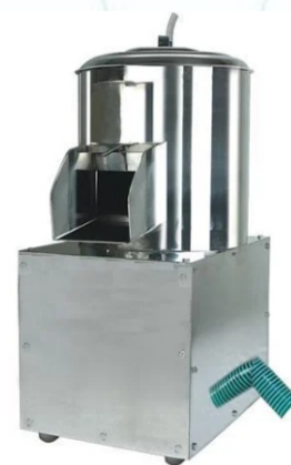
Potato Peeling Machine