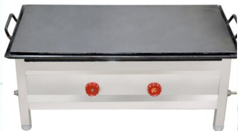
Dosa Cooking Range