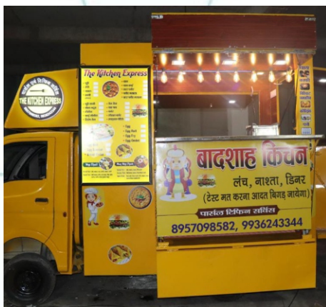
Street Food Vehicle