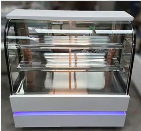
Cake Display Counters