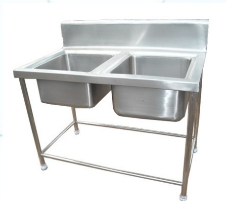
Double Sink Unit