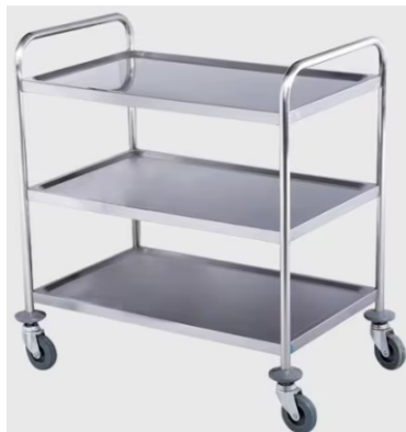
SS Service Trolley