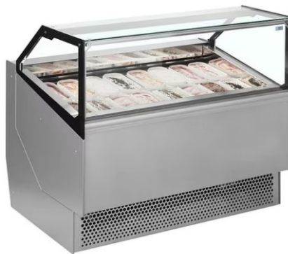
Ice-Cream Display Counter