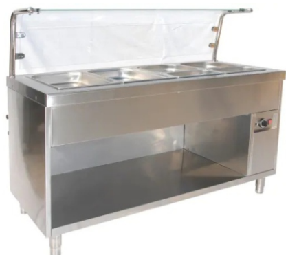
Hot Bain Service Counter