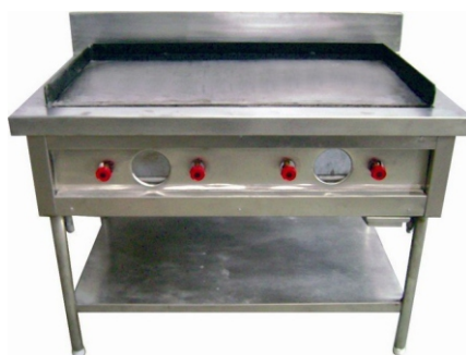
Dosa Plate With Stand