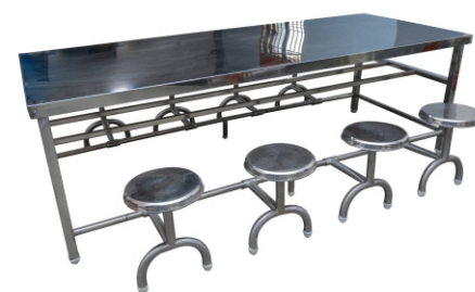
SS Dining Table