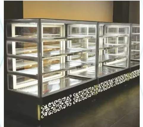
Sweet Display Counter