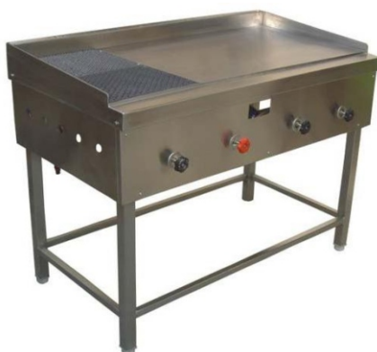
Chapati Plate With Puffer