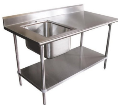
Work Table With Sink