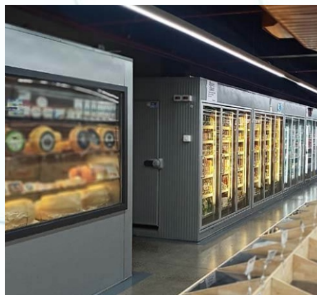
Walking Chiller Room