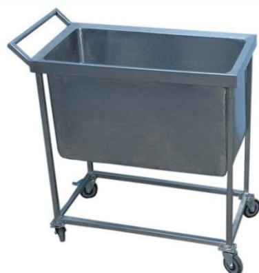
Hot Bain Service Counter