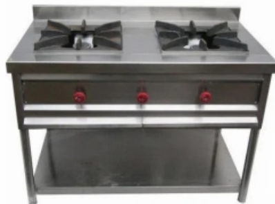
Indian Burner Range