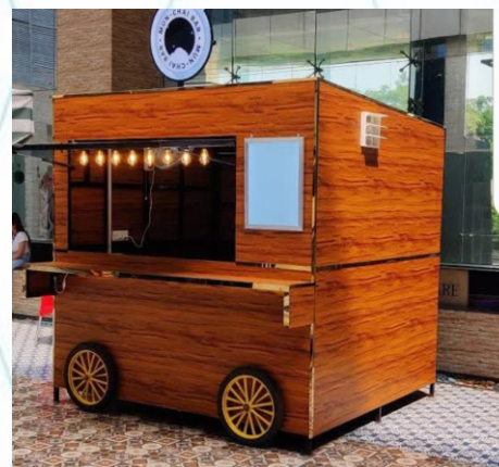
Street Food Counter