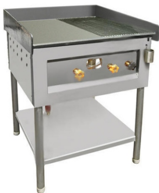
Griller / Griddle Plate