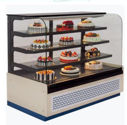
Cake SS Display Counter