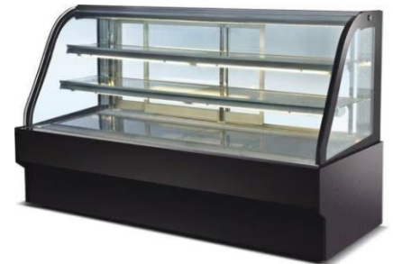
Bakery Display Counter