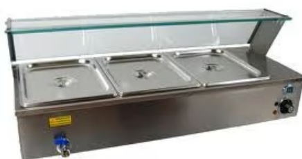
Hot Bain service counter (Table top)