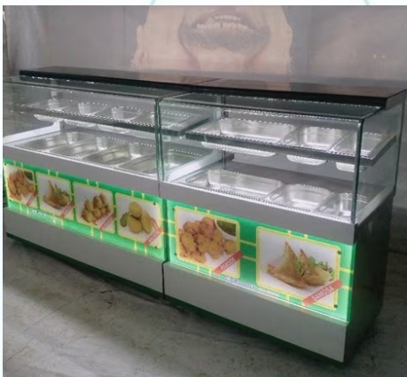
Chat Counter Display