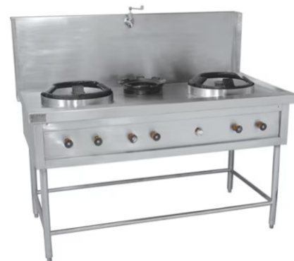
Chinese Burner Range