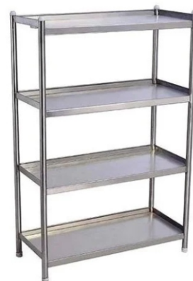
Clean Dish Rack