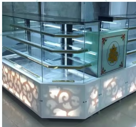
M Cool Display Counter